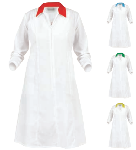
ARGYLE FOOD INDUSTRY SMOCK SMARTZONE 150gsm Polycotton Zip Closure

Code SMNPCLSZ / Colours Yellow, Red, Blue, Green Sizes 10, 12, 14, 16, 18, 20, 22, 24, 26, 28 & 32