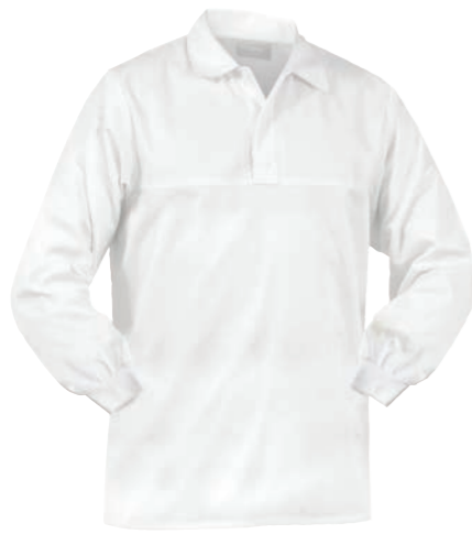
ARGYLE FOOD INDUSTRY JERKIN 240gsm Polycotton Dome Closure

Code JFDPCMW / Colour White / Sizes XS-4XL & 6XL