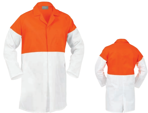
ARGYLE FOOD INDUSTRY DUSTCOAT 190gsm Day Compliant Polycotton Dome Closure

Code DFDPCWL / Colour White/Fluoro Orange / Sizes 4-13