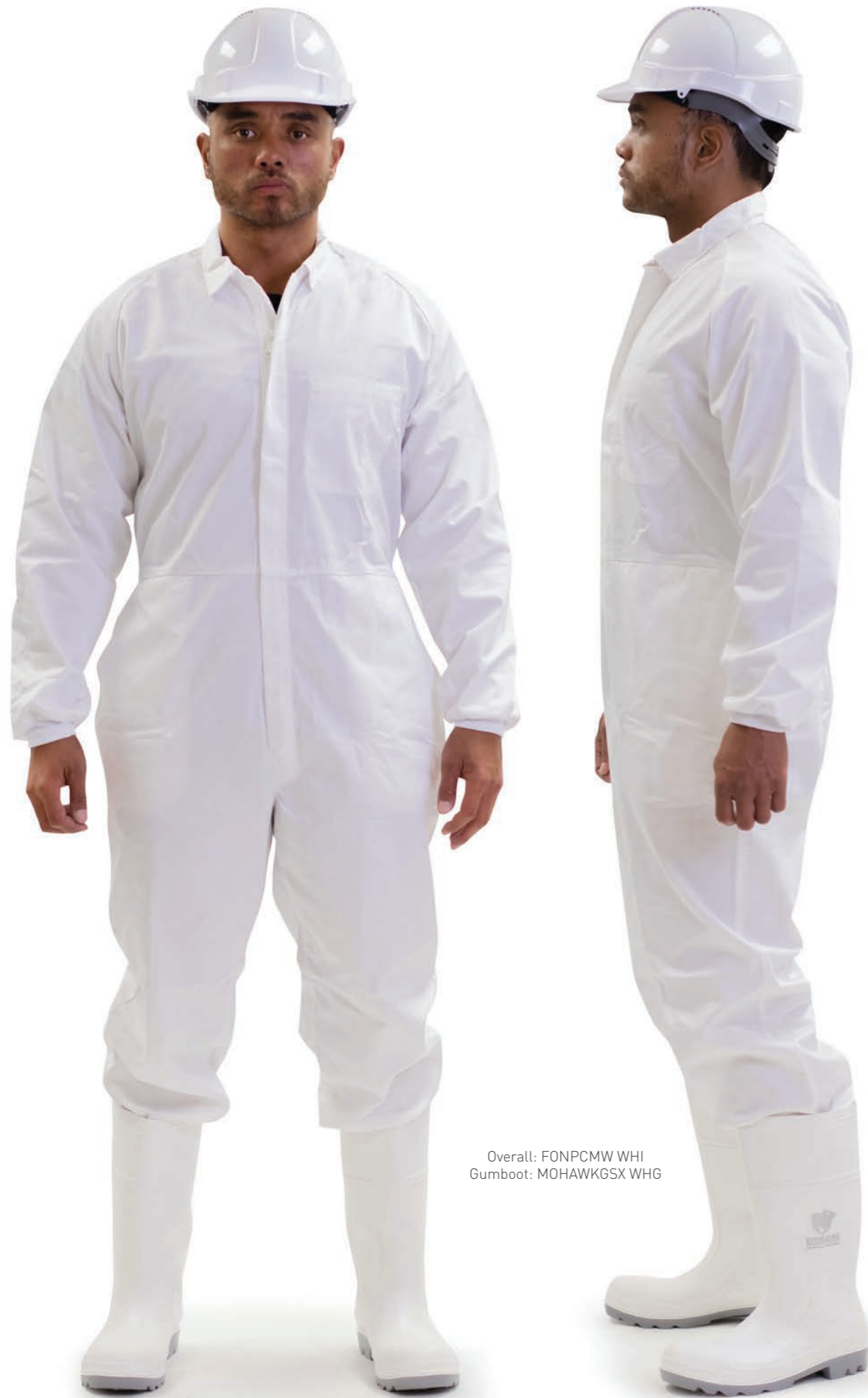
Overall: FONPCMW WHI Gumboot: MOHAWKGSX WHG