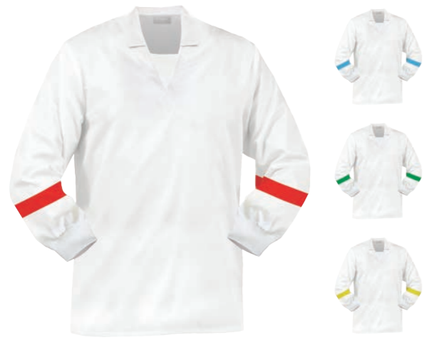
ARGYLE FOOD INDUSTRY JERKIN SMARTZONE 270gsm Polycotton V-Neck Rib Cuff

Code JFPCSZ / Colours Yellow, Red, Blue, Green Sizes XS-4XL & 6XL