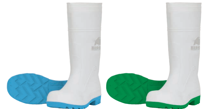
BISON MOHAWK SAFETY GUMBOOT SMARTZONE PVC/Nitrile Food Industry

Blue Code MOHAWKGSX-BLU / Green Code MOHAWKGSX-GNWH / Yellow Code MOHAWKGSX-YEL / Sizes 4-13