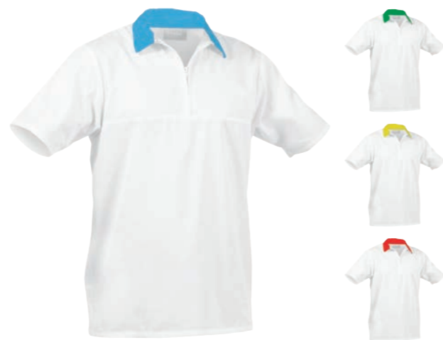
ARGYLE FOOD INDUSTRY JERKIN SMARTZONE 190gsm Polycotton Zip Closure

Code JSNPCLSZ / Colours Yellow, Red, Blue, Green Sizes XS-4XL & 6XL