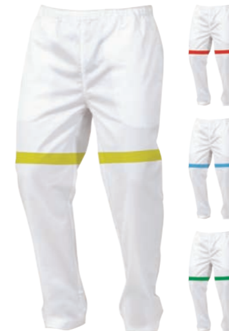
ARGYLE FOOD INDUSTRY TROUSER SMARTZONE 240gsm Polycotton

Code TFPCMWSZ / Colours Yellow, Red, Blue, Green Sizes XS-4XL & 6XL