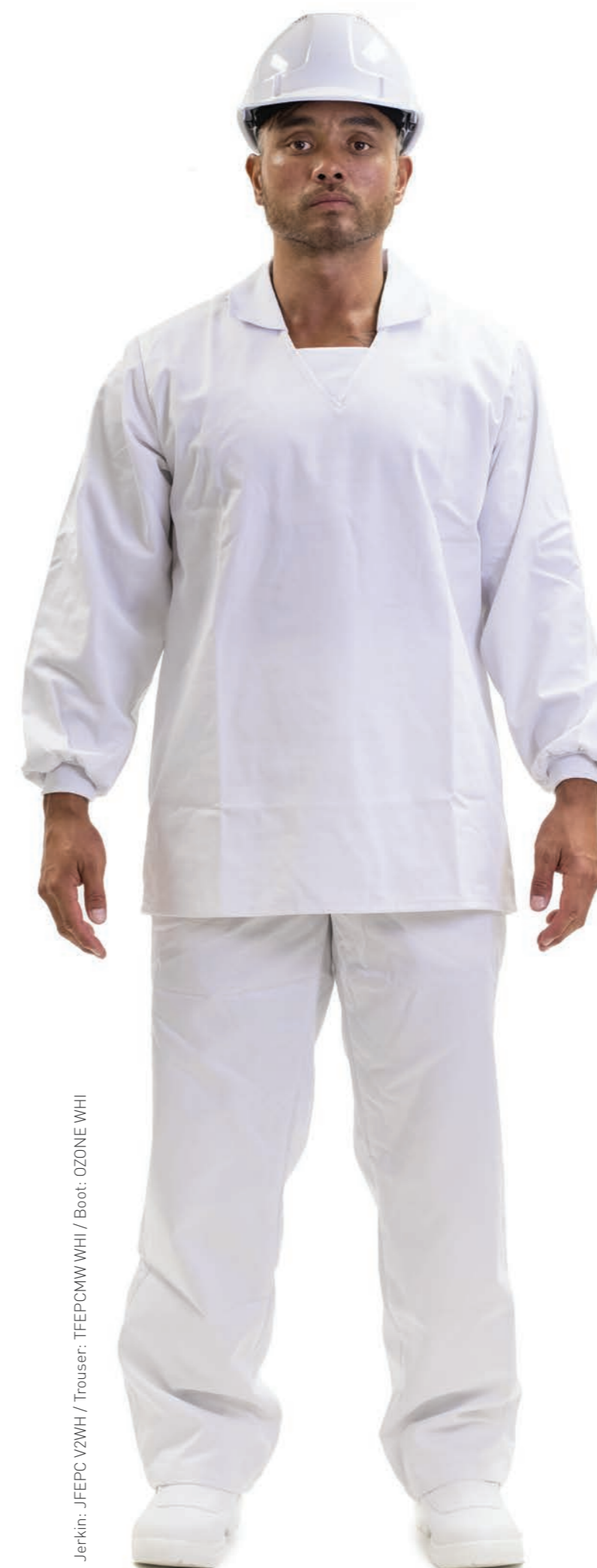
Jerkin: JFEPC V2WH / Trouser: TFEPCMW WHI / Boot: OZONE WHI