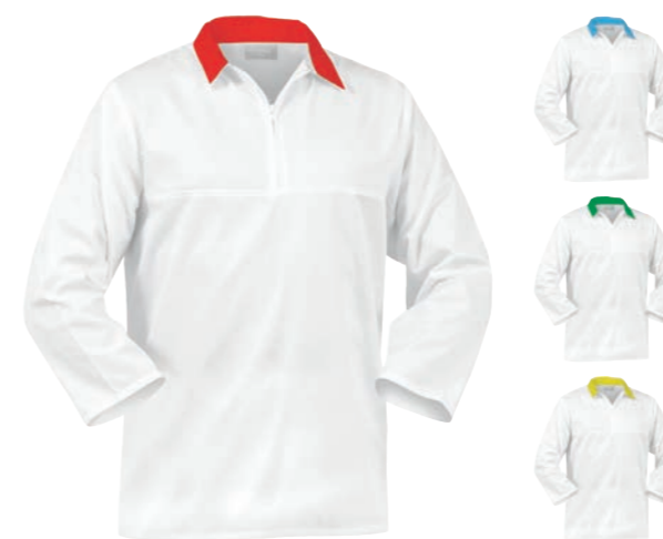
ARGYLE FOOD INDUSTRY JERKIN SMARTZONE Polycotton Zip Closure

AVAILABLE IN 2 DIFFERENT WEIGHTS: 190GSM JERKIN Code JFNPCLSZ in sizes XS-4XL & 6XL 240GSM JERKIN Code JFNPCMWSZ in sizes XS-4XL & 6XL Colours Yellow, Red, Blue, Green