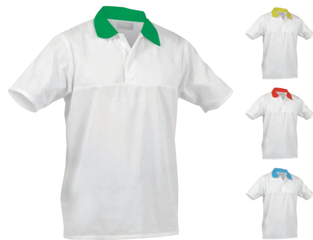
ARGYLE FOOD INDUSTRY JERKIN SMARTZONE 240gsm Polycotton Dome Closure

Code JSDPCMWSZ / Colours Yellow, Red, Blue, Green Sizes XS-4XL & 6XL