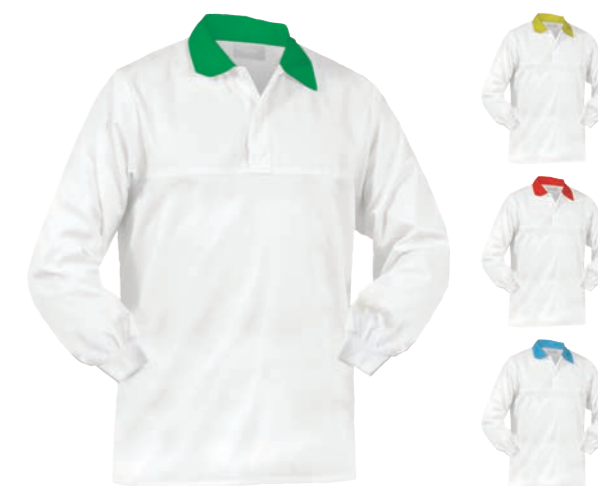
ARGYLE FOOD INDUSTRY JERKIN SMARTZONE 240gsm Polycotton Dome Closure

Code JFDPCMWSZ / Colours Yellow, Red, Blue, Green Sizes XS-4XL & 6XL