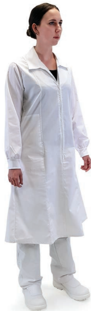
Smock: SMNPCLW WHI / Trouser: TEEPCMW WHI / Boot: OZONE WHI