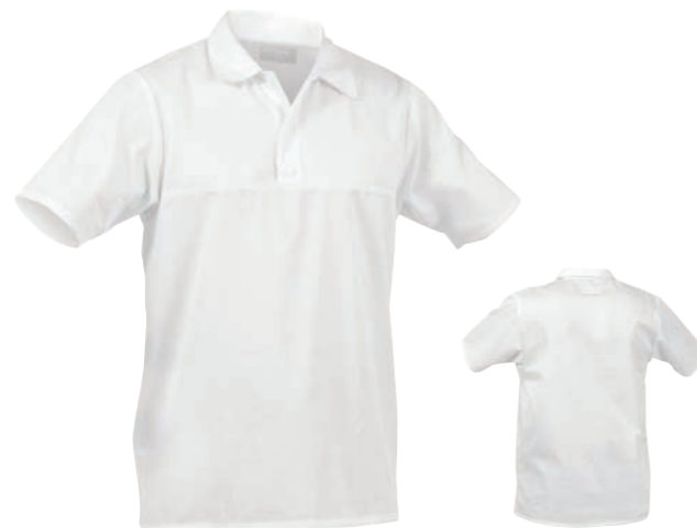
ARGYLE FOOD INDUSTRY JERKIN 240gsm Polycotton Dome Closure

Code JSDPCMW / Colour White / Sizes XS-4XL & 6XL