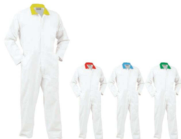
ARGYLE FOOD INDUSTRY OVERALL SMARTZONE Polycotton Zip Closure

Please contact your sales rep for info on lead times and quantities on all Smartzone products.