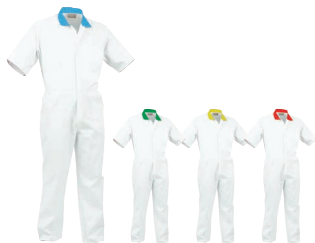
ARGYLE FOOD INDUSTRY OVERALL SMARTZONE Polycotton Zip Closure

AVAILABLE IN 2 DIFFERENT WEIGHTS: 190GSM OVERALL Code FSNPCLSZ in sizes 4-14, 16 & 18 240GSM OVERALL Code FSNPCMWSZ in sizes 4-14, 16 & 18 Colours Yellow, Red, Blue, Green