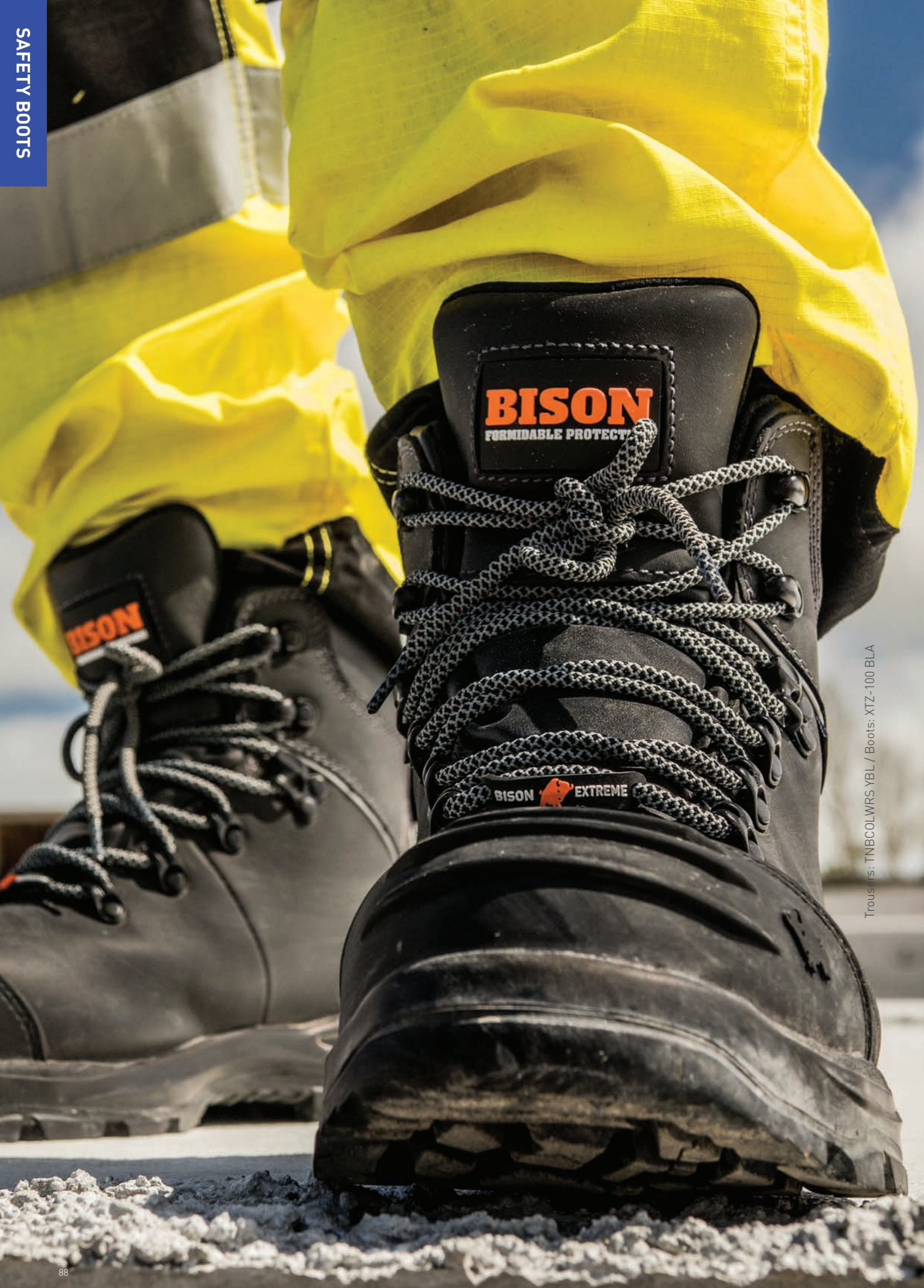
Trousers: TNBCOLLWRS YBL / Boots: XTZ-100 BLA