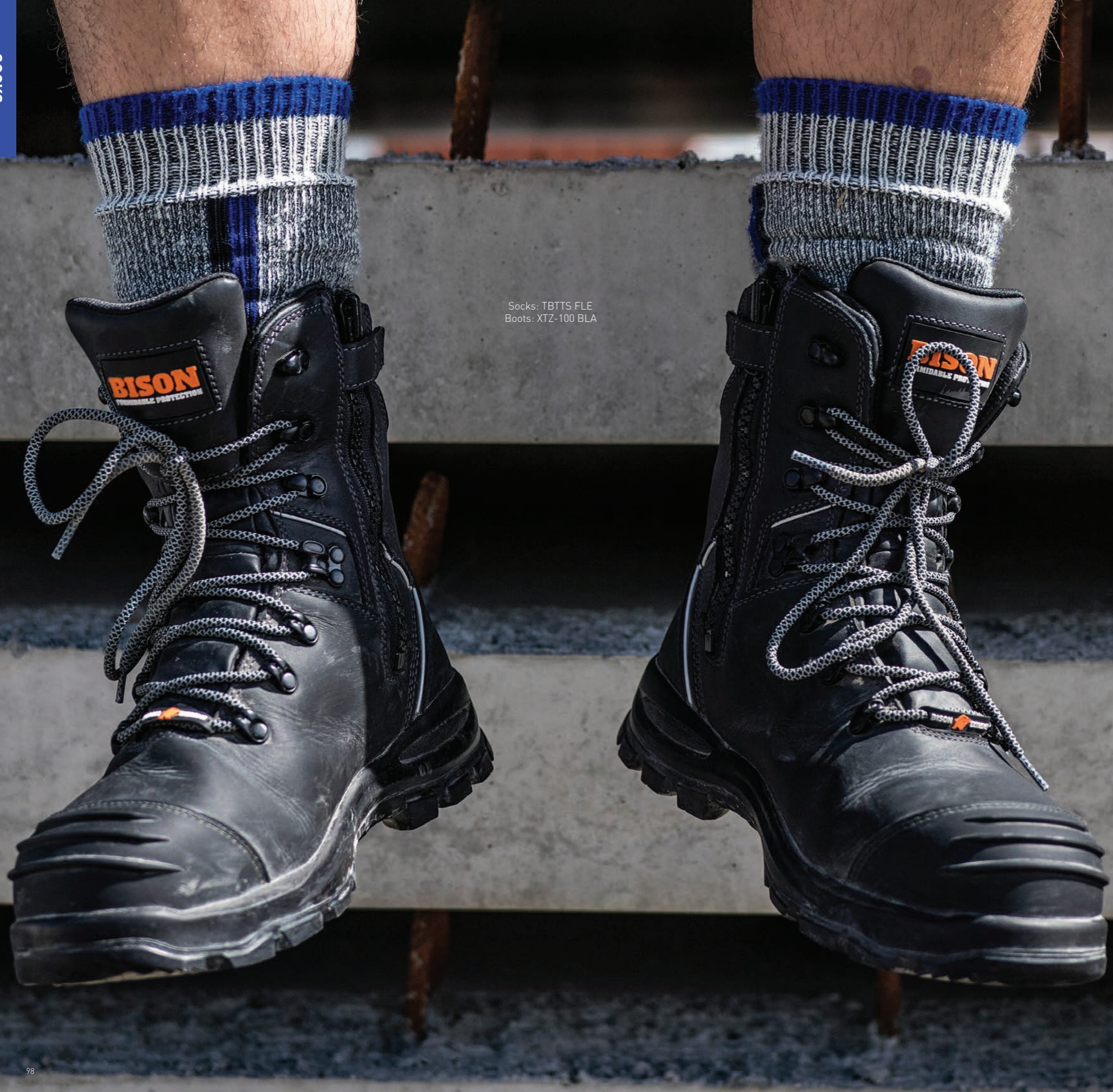
Socks: TBTT5 FLE Boots: XTZ-100 BLA