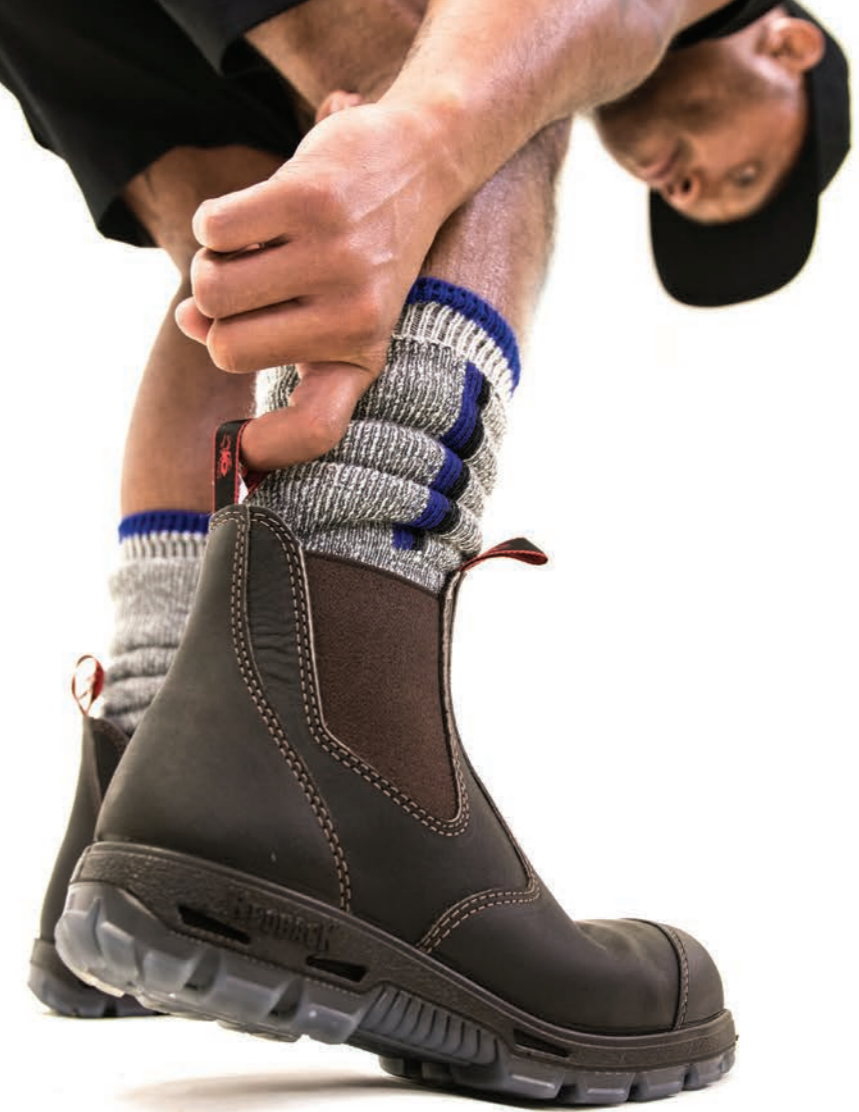
Shorts: SCBPC CHA Socks: TBTT5 FLE Boots: USBOKS BRO