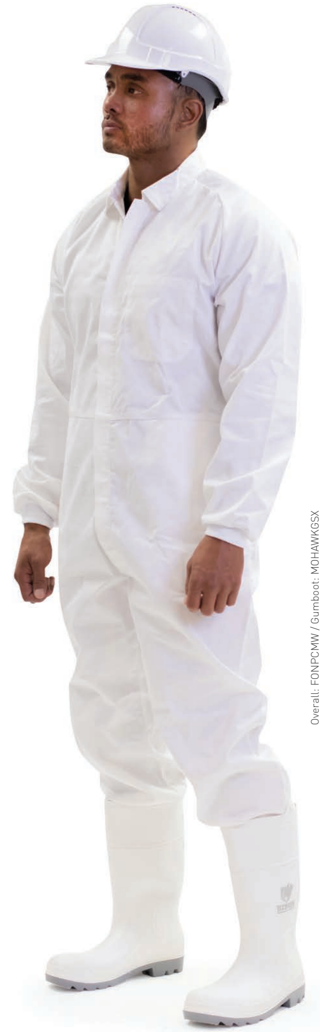
Overall: FONPCMW / Gumbboot: MOHAWKGSX