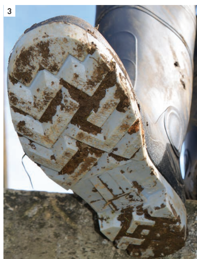
Argyle Performance Workwear Guide / www.argyleperformanceworkwear.com / 97