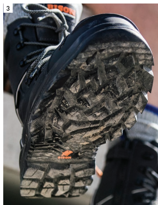
Argyle Performance Workwear Guide / www.argyleperformanceworkwear.com / 89