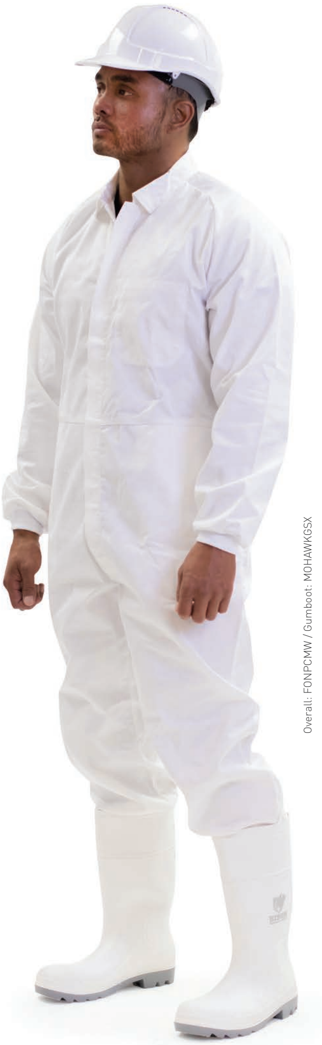
Argyle Performance Workwear Guide / www.argyleperformanceworkwear.com / 95