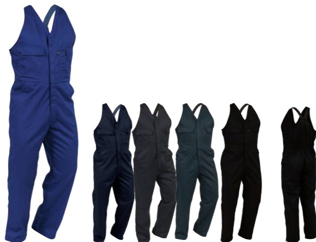
ARGYLE BIB OVERALL 270gsm Polycotton Zip Closure

Code EAZPC / Colour Royal in sizes 3-14 & 16 / Colours Navy, Charcoal & Spruce in sizes 4-14 & 16 / Colour Black in sizes 4-14