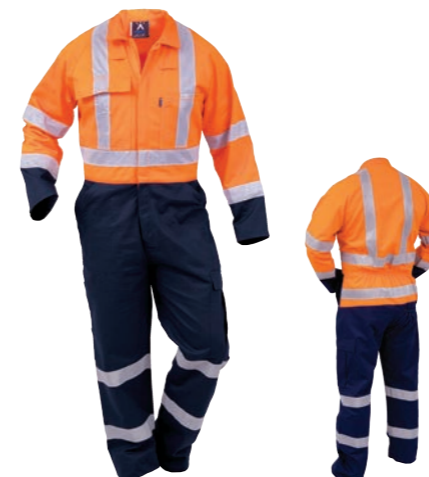
ARGYLE DAY/NIGHT OVERALL 310gsm 100% MAXIM Cotton Zip Closure

Code I-CTPCO / Colour Navy/Orange / Sizes 5-13