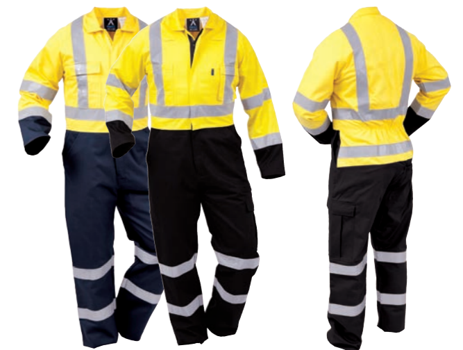
ARGYLE DAY/NIGHT OVERALL 300gsm 100% Cotton Zip Closure

Code CTPCO / Colours Navy/Hi Vis Yellow & Navy/Orange in sizes 4-14 & 16 / Colour Black/Yellow in sizes 5-14 & 16