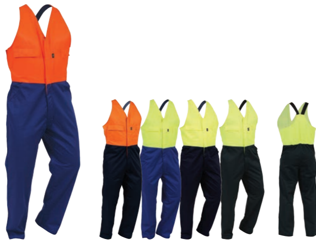
ARGYLE CONTRAST BIB OVERALL 270gsm Polycotton Zip Closure

Code EDZPC / Colour Royal/Fluoro Orange in sizes 4-13 / Colour Navy/Orange in sizes 4-14 & 16 / Colours Royal/Fluoro Yellow & Navy/Fluoro Yellow in sizes 6 -14 / Colour Spruce/Fluoro Yellow in sizes 4-14