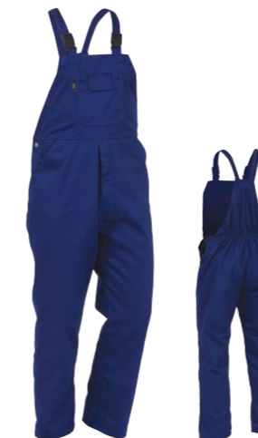
ARGYLE BIB OVERALL 270gsm Polycotton Zip Fly Closure

Code BIZPC / Colour Royal / Sizes 4-14 & 16