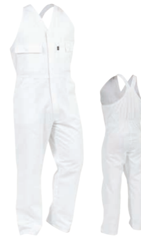
ARGYLE PAINTERS BIB OVERALL 240gsm 100% Cotton Zip Closure

Code EPZCOMW / Colour White / Sizes 4-14 & 16