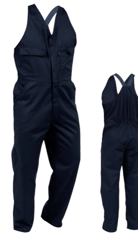
ARGYLE BIB OVERALL 300gsm 100% Cotton Dome Closure

Code EADCO / Colour Navy / Sizes 5-14 & 16