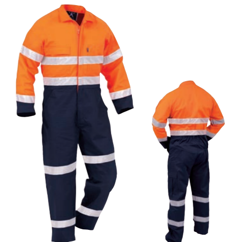
ARGYLE DAY/NIGHT SUNSAFE OVERALL 310gsm 100% MAXIM Cotton Zip Closure

Code I-DSPCO / Colour Navy/Hi Vis Orange / Sizes 5-14 & 16