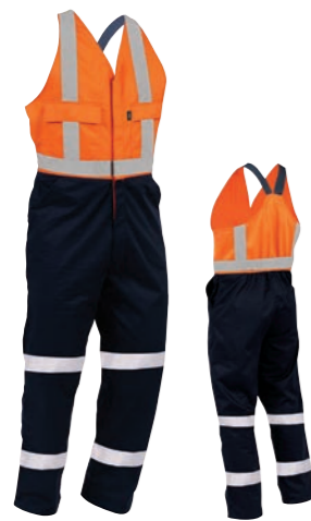
ARGYLE TAPED BIB OVERALL 300gsm 100% Cotton Zip Closure

Code ETPCO / Colour Navy/Orange / Sizes 5-14 & 16