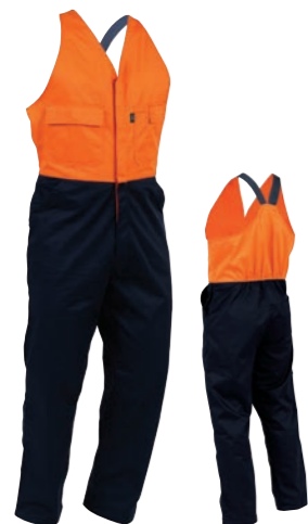
ARGYLE CONTRAST BIB OVERALL 300gsm 100% Cotton Dome Closure

Code EDDCO / Colour Navy/Orange / Sizes sizes 4-14 & 16