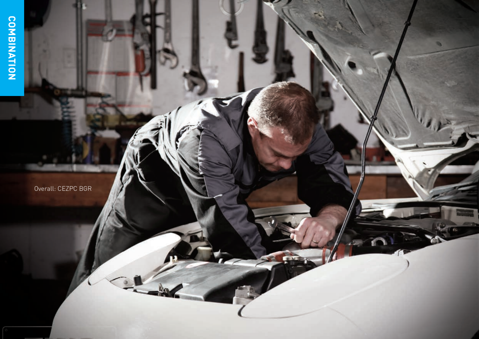
Overall: CEZPC BGR