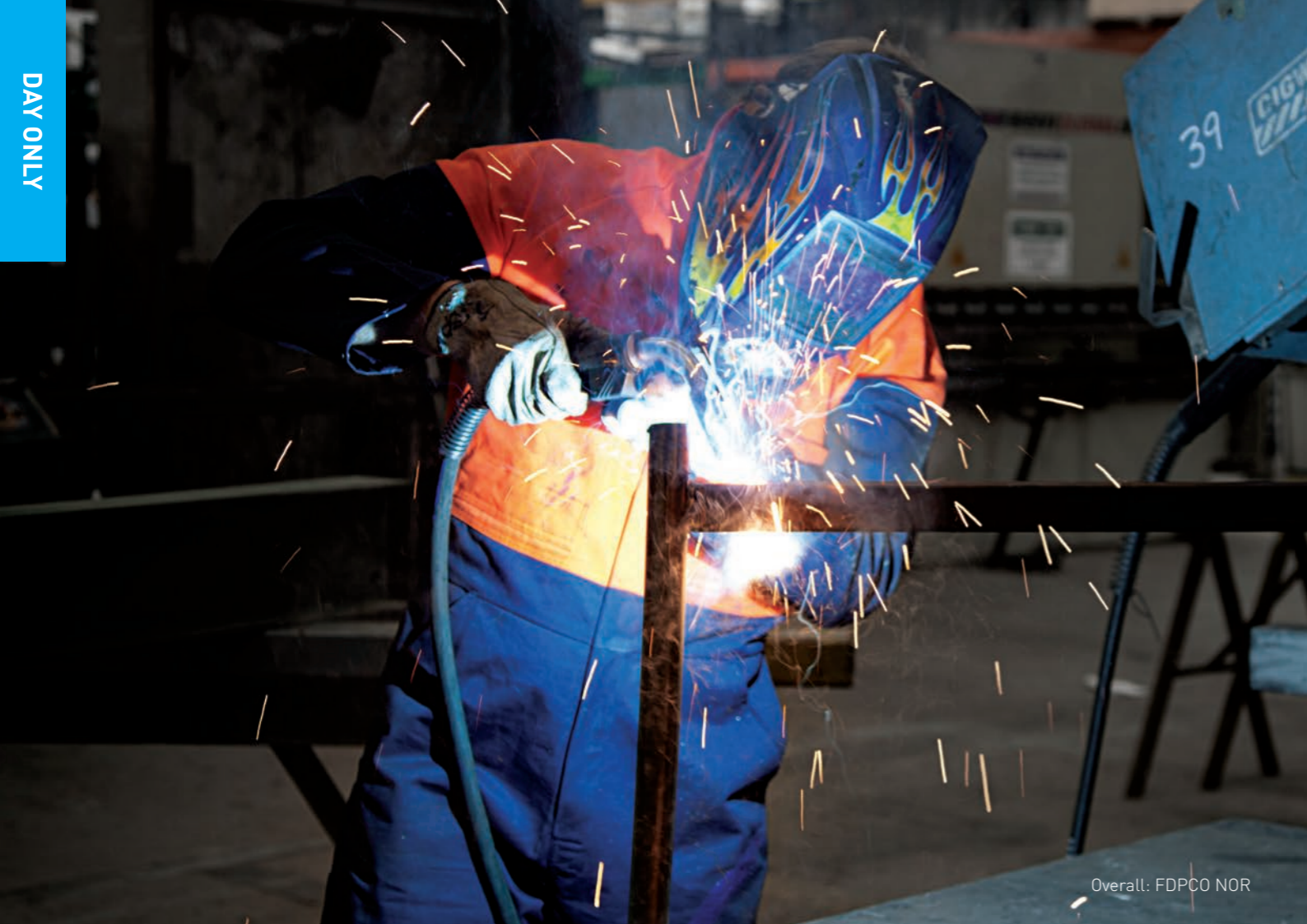
Overall: FDPC0 NOR