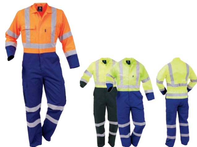
ARGYLE DAY/NIGHT OVERALL 240gsm Polycotton Zip Closure

Code TTPPCLT / Colour Royal/Fluoro Orange in sizes 4-14 & 16 / Colour Spruce/Fluoro Yellow in sizes 6-14 & 16 / Colour Royal/Fluoro Yellow in sizes 6-14