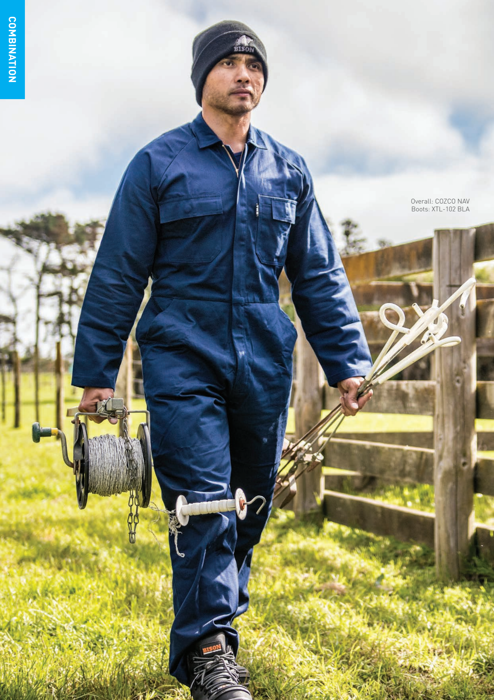
Overall: COZCO NAV Boots: XTL-102 BLA