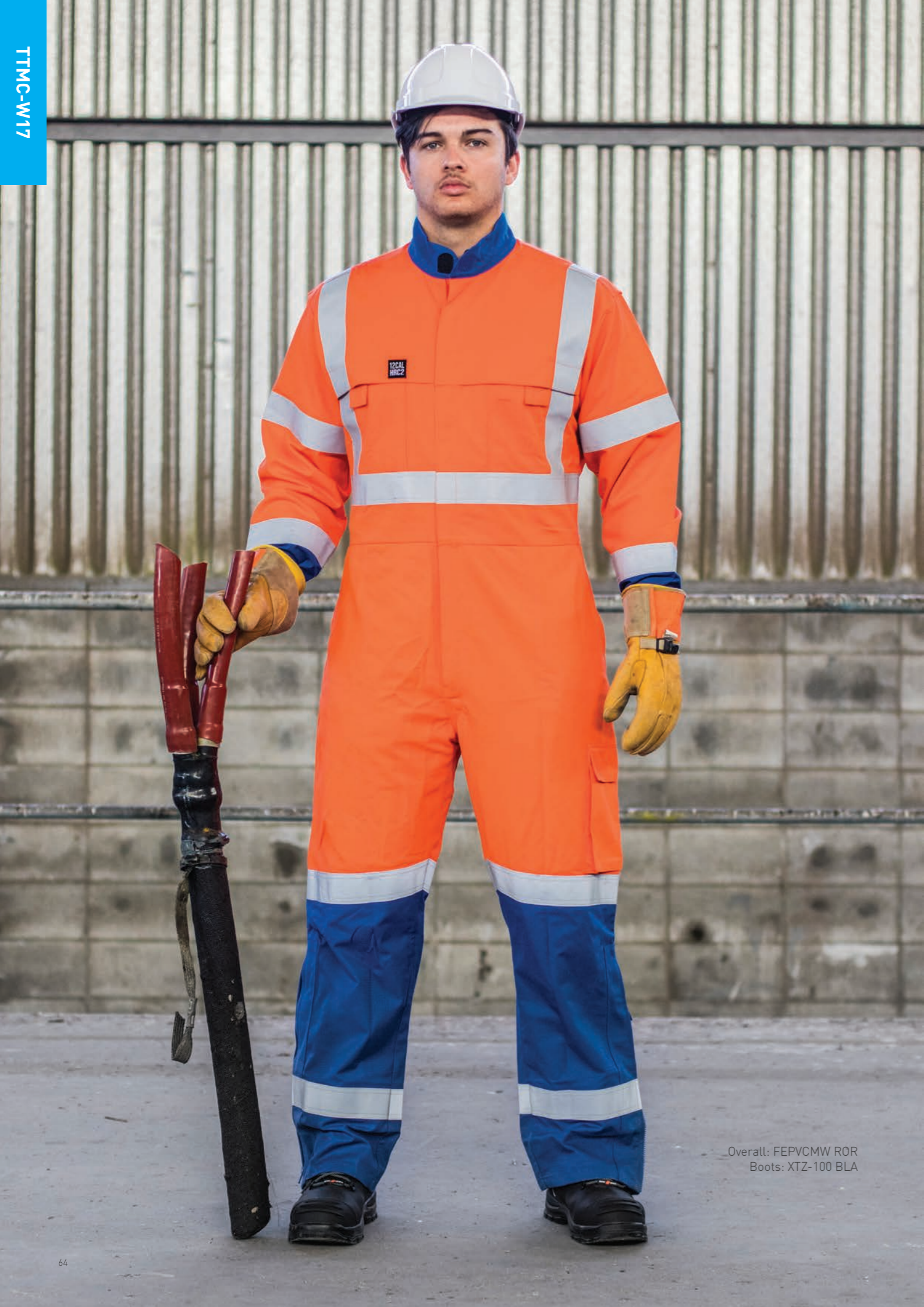
Overall: FEPVCMW ROR Boots: XTZ-100 BLA