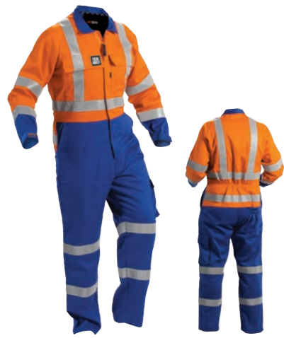
ARGYLE DAY/NIGHT FR OVERALL 240gsm Natural Fibres Zip Closure

Code FTPCNLW / Colour Royal/Orange / Sizes 5-14