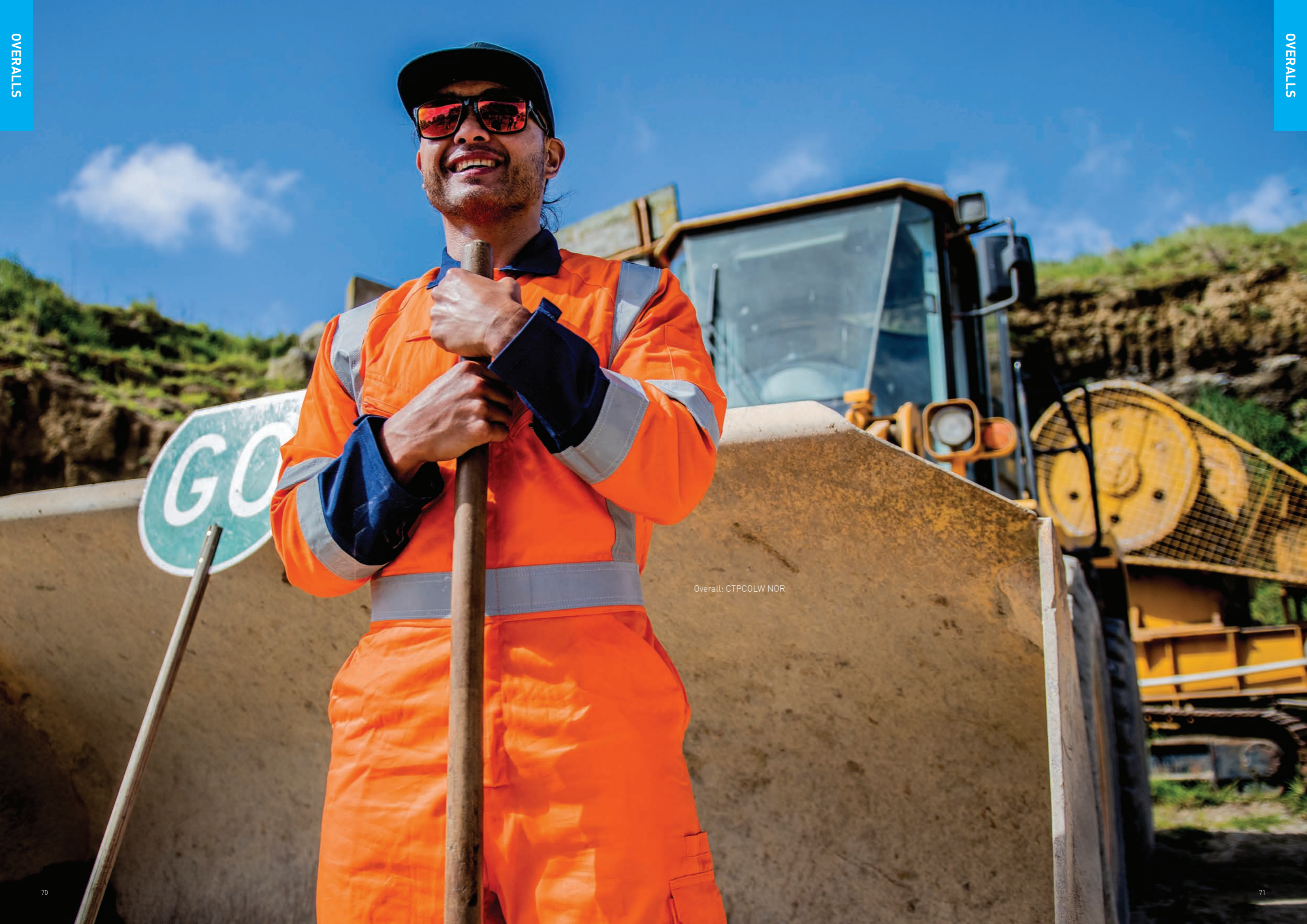
Overall: CTPCOLW NOR