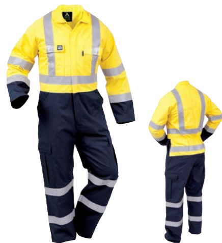
ARGYLE DAY/NIGHT FR OVERALL 325gsm Flameguard 100% Cotton Dome Closure

Code FTDCO / Colour Navy/Hi Vis Yellow / Sizes 6-16