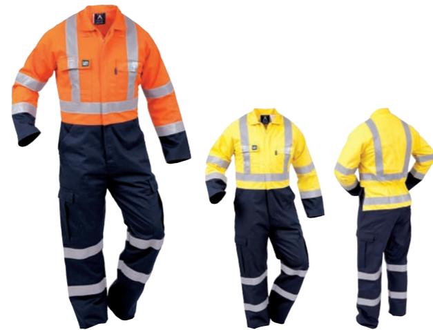
ARGYLE DAY/NIGHT FR OVERALL 325gsm Flameguard 100% Cotton Zip Closure

Code FTPCOLT / Colour Navy/Hi Vis Yellow in sizes 5-14 & 16 Colour Navy/Orange in sizes 3-14 & 16