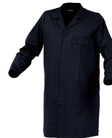
ARGYLE DUSTCOAT 300gsm 100% Cotton Dome Closure